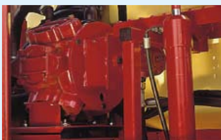
463 with hydraulic drive